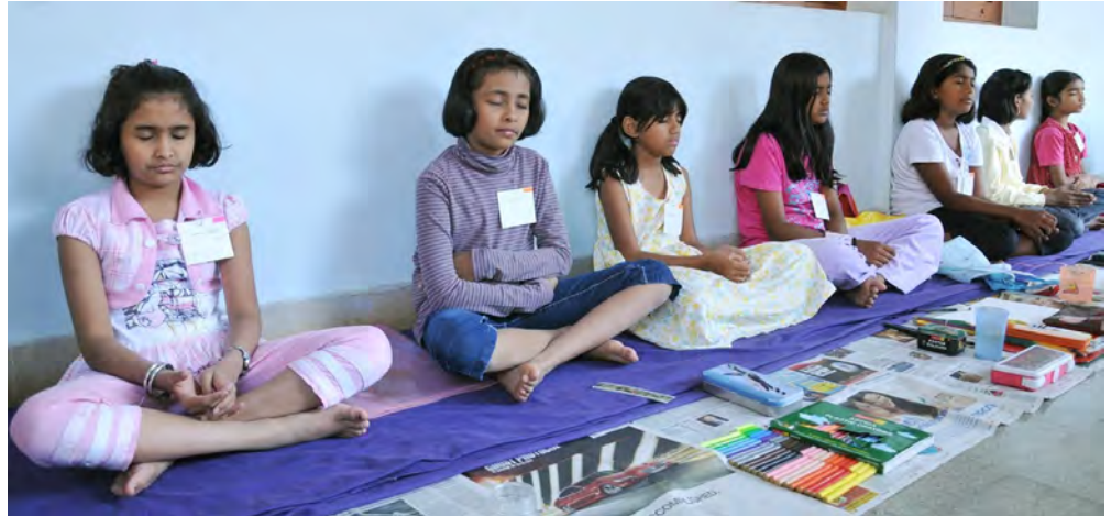
Photo: SRCM Banashankari Ashram, Bangalore, India, Universal Children's Day 2011 Silent prayer before painting

"...This is a huge exercise, in simply understanding the grandiosity or the audacity of thought behind it, that we can make a difference by simply changing ourselves and by simply praying. I don't think I need to reiterate the importance of this prayer. It is the basis of this entire program. Please feel free to use these days to have events in your communities, where we really believe in One World, One Family, inviting people to pray together, because that is going to be the bedrock of this family."