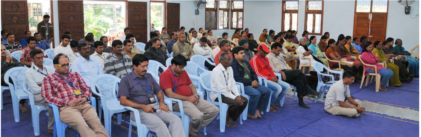
Photo: SRCM Banashankari Ashram, Bangalore, India, Universal Children's Day 2011

Completed paintings hung around the ashram while the children had refreshments.