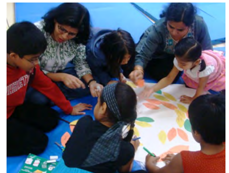
Photo: SRCM Plainsboro, New Jersey, USA Universal Children's Day 2011

Afterward, they quietly enjoyed beautiful pages of photos and drawings from Children of the World How We Live, Learn, and Play in Poems and Photographs . Heartfelt readings of some of the poems helped empathize with children from di-