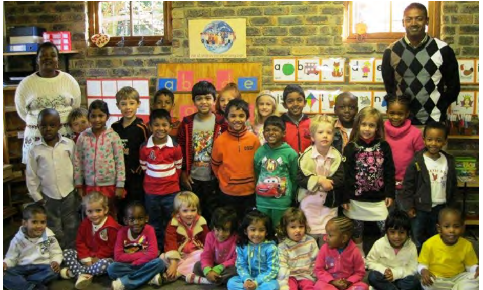
Photo: SRCM Montessori School, Johannesburg, South Africa, Universal Children's Day 2011

Lenasia Ashram celebrated Universal Children's Day on 19 November 2011. It turned out to be a fun filled day for children and their parents, and many abhyasis were involved in lending a hand to make the occasion a successful and memorable