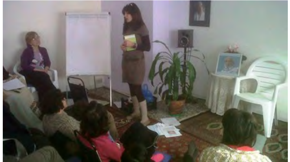
Universal Children's Day 2011

out how they all depended on each other. Making a jigsaw puzzle together, they became aware of how they needed to work together in order to complete the task, of how they were all part of a whole, and that if one piece was missing, the whole wasn't complete. Later, all joined in a prayer for children in the world. Their suggestions for the prayer were that 'all children are safe, not scared, and happy'.