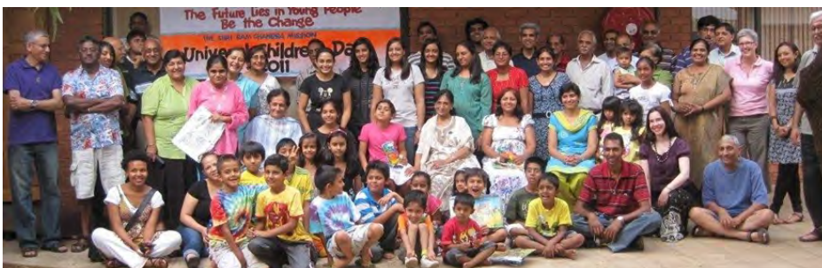
Photo: SRCM Lenasia Ashram, South Africa, Universal Children's Day 2011

I wish for one, I wish for thee My prayer for you means everything to me I ask for your help and for your blessing Please answer my prayer and don't leave me guessing