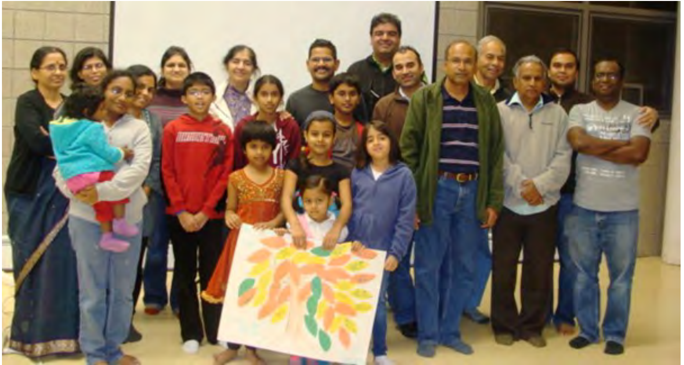
Universal Children's Day 2011

group between three and eleven years attended the program. The meaning of Universal Children's day was introduced with the theme of My world and me . Everyone was to draw their future world as they imagined it. The highlight of the event was the Tree of Values. The children participated in making a tree on and wrote values that made them a better person on the leaves. All prayed for five minutes for universal welfare