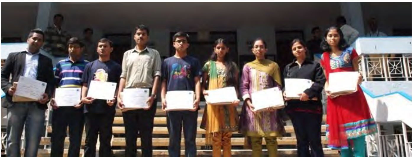
Winners of the All-India Essay Event display their awards

T he prestigious All-India Essay Writing Event is organised by Shri Ram Chandra Mission in collaboration with the United Nations Information Centre for India and Bhutan. The annual essay event commemorates UN Youth Day, 12 August, across India with essay topics given by Revered Master. "Change and the world changes for you" was the topic for 2011 Category 1 (Class 9 to 12) and Category 2 (Upper Grades and Post Graduate) topic was "Success must bestow humility".