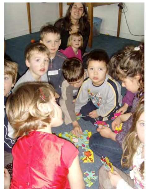
Universal Children's Day 2011