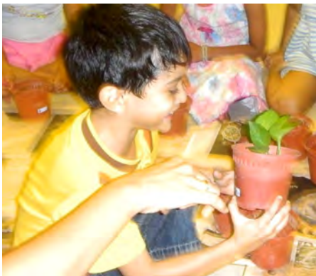
Universal Children's Day 2011

M embers and children of Shri Ram Chandra Mission celebrated Universal Children's Day with their guests during the month of November 2011. While engaged in artwork, crafts, and story telling, the themes led participants to the importance of prayer and developing values in creating a future world that they could imagine. Local centres in Singapore, India, Ireland, Italy, South Africa, Australia and North America observed the occasion.