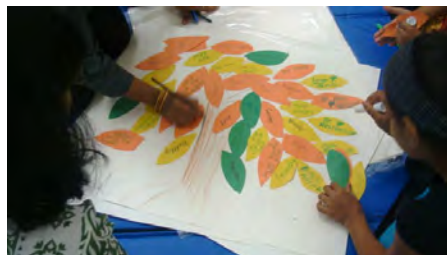
Photo: SRCM Plainsboro, New Jersey, USA Universal Children's Day 2011