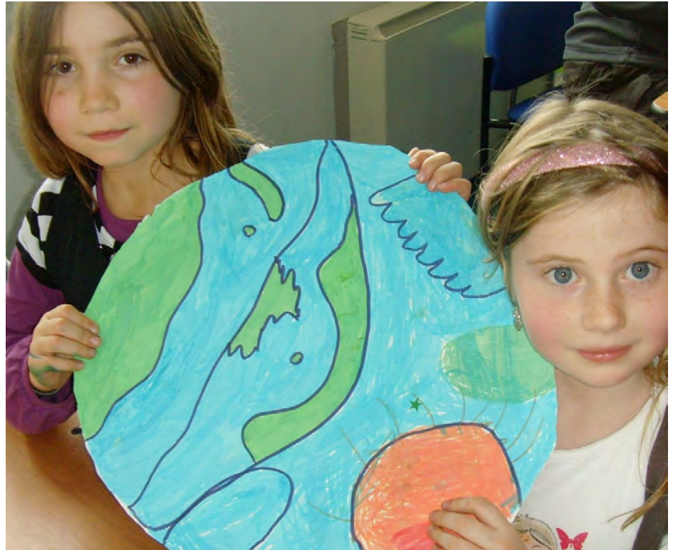
Universal Children's Day 2011

Our Future World, What We Would Like to Be was the theme for the UN Children's Day celebration at the Singapore meditation centre. It was an