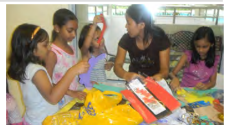
Photos: SRCM Singapore Centre, Universal Children's Day 2011