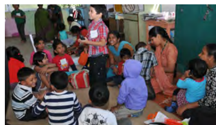
Photos: SRCM Banashankari Ashram, Bangalore, India, Universal Children's Day 2011