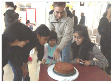
Melbourne celebrates UN Day of Families