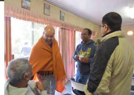
Perth Jarradale Retreat

The many presentations given were inspiring. A simple activity using 'Whispers', Rev. Babuji's messages, had a profound effect on abhyasis gathered. About ten people were asked to select a reading from any of the 'Whispers' that had made an impact on them. This was then read out with a simple explanation as to why it was chosen. If necessary the reading was repeated. No comment or discourse followed each reading with each person just absorbing the simple yet utterly profound truths