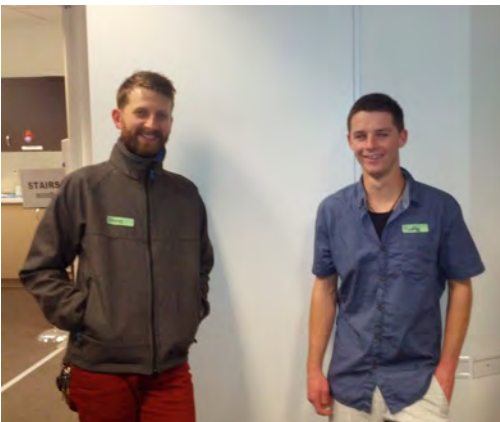
New abhyasis at the integration meeting

There was no particular format, we kept it open ended and simply followed our hearts. The prefects too enjoyed meeting the new starters. For next month's meeting the plan is to have some practising abhyasis as well as prefects.