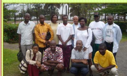
From top down: Abhyasis from Côte-d'Ivoire, Gabon and Cameroon