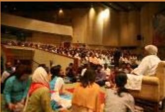
Iranian Club, 24 Oct. 2008, Dubai