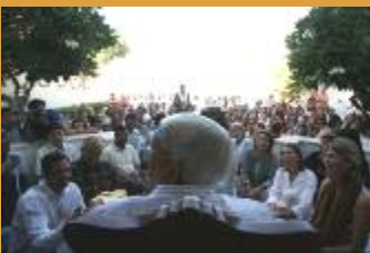
25 October, 2008, Dubai