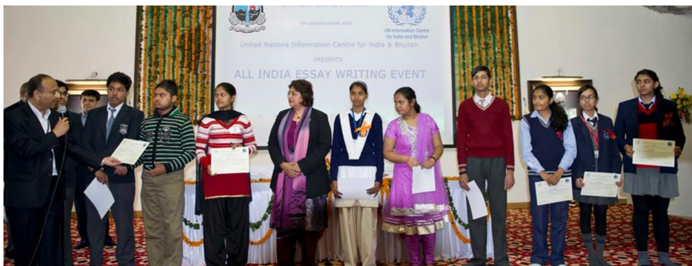
Photo: SRCM 2013, All-India Essay Writing Event 2012, Prize Distribution Ceremony