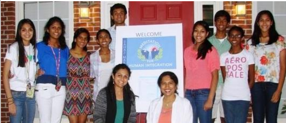
PHOTO: SRCM 2013 International Day of Peace 2012 Athens, Alabama, USA