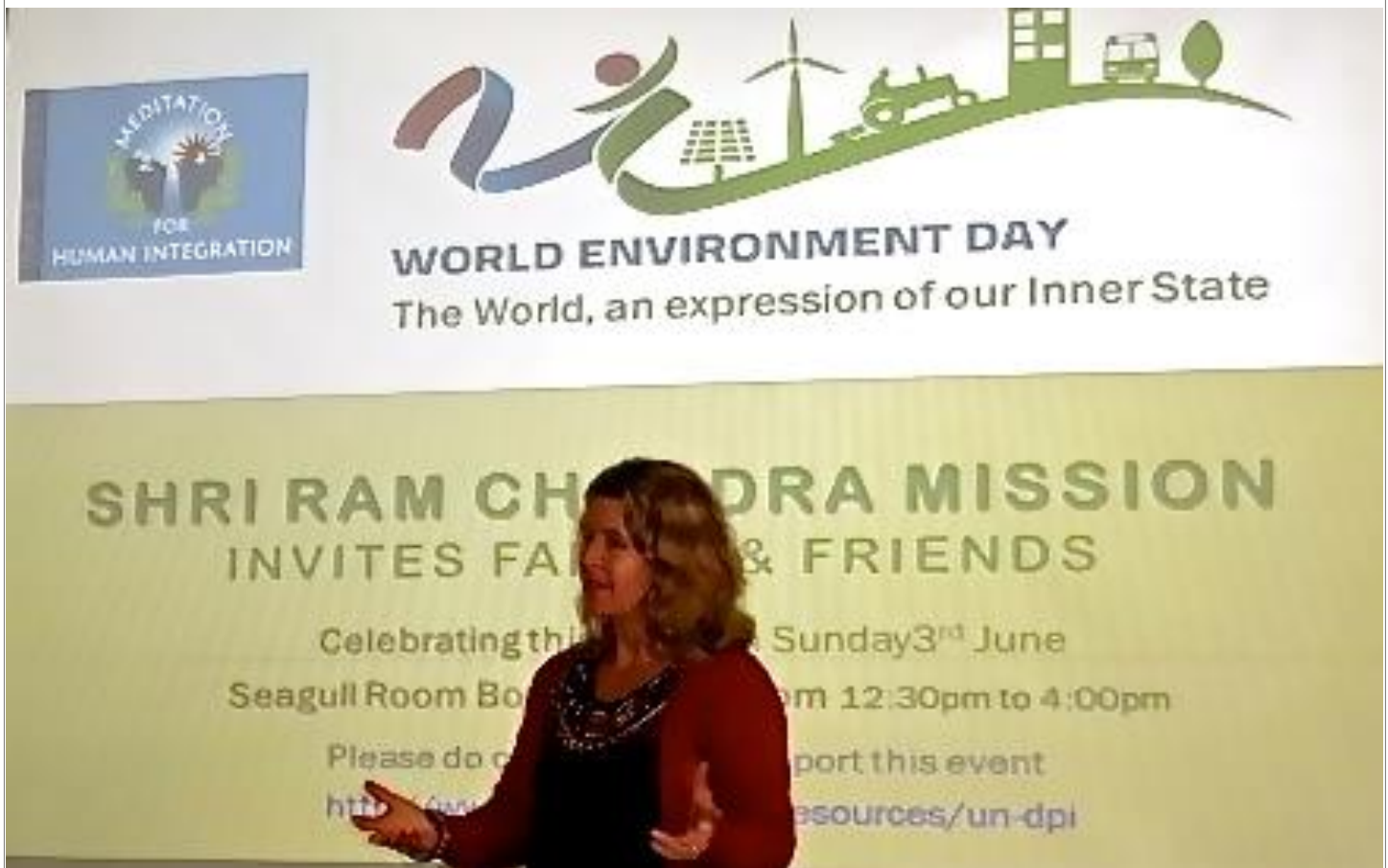
2013 World Environment Day 2012, Oceania

A ustralia- Sydney, Melbourne, Brisbane, New Zealand- Dunedin, Fiji-Lautoka