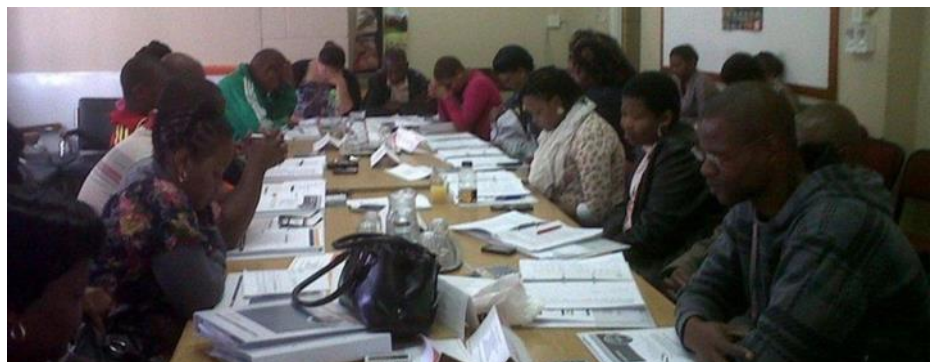
PHOTO: SRCM 2013 South Africa. A group of delegates in Aliwal North participate in the Universal Prayer on the International Day of Peace 2012

South Africa commemorated International Day of Peace 2012 with the hope that more people will recognise the value and efficacy of prayer in helping to create a compassionate, tolerant and peaceful world for all human beings. Prayer programmes were held on the International Day of Peace in Lenasia and Port Elizabeth.