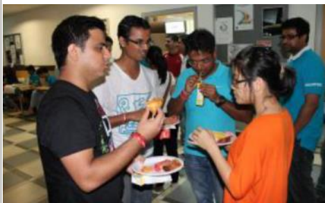
International Youth Day 2012, Singapore

Hall. Youth from Perth Centre coordinated and organised the activities. Youth, children and the young at heart came together creating an enjoyable, fun-filled and purposeful day. A silent prayer began the programme, followed by power-