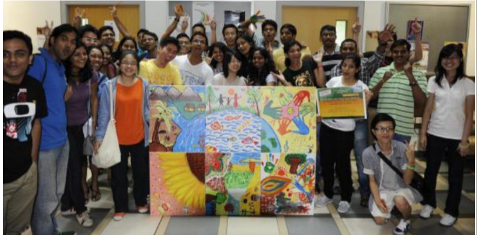
International Youth Day 2012, Singapore

SRCM Centre, Perth, Australia commemorated the United Nations International Day of Youth using the theme, "Youth, A Time of Promise." A call for global action to develop and engage in partnerships with and for youth was made. Forty people of all ages attended the event at the Bull Creek Community