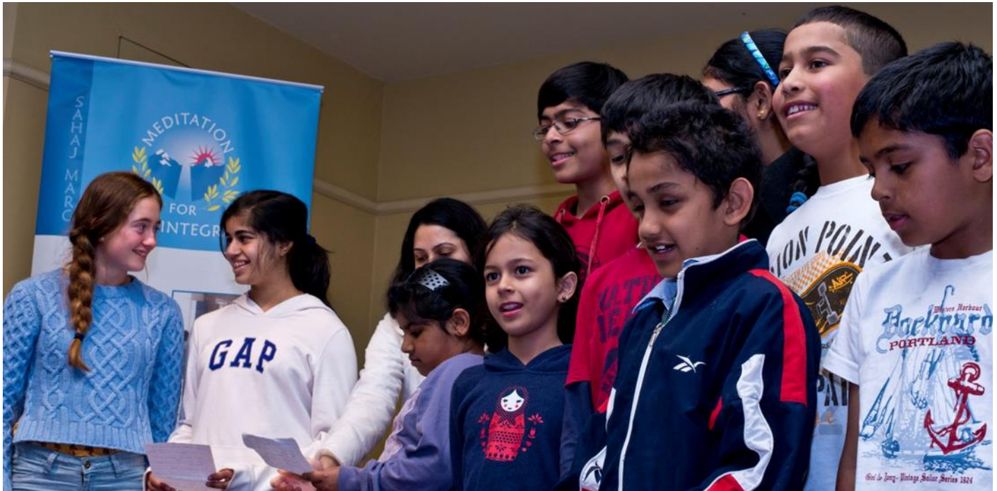
Photo: SRCM 2013 International Day of Peace 2012 Children's Choir Sydney, Australia

O ceania International Day of Peace 2012 Commemorations took place from Sydney and Toowoomba Australia, to Wellington and Dunedin, New Zealand and Lautoka, Fiji. 'This Way of the Heart' was the theme at the highlight event hosted in Sydney, emphasising the difference that one person can make by effectively using the heart and mind to achieve daily peace. One hundred-fifty SRCM members with their children attended a national weekend seminar at Leura, in the Blue Mountains. The public, family members and friends were invited to join the programme and hold positive thoughts and goodwill for peace.