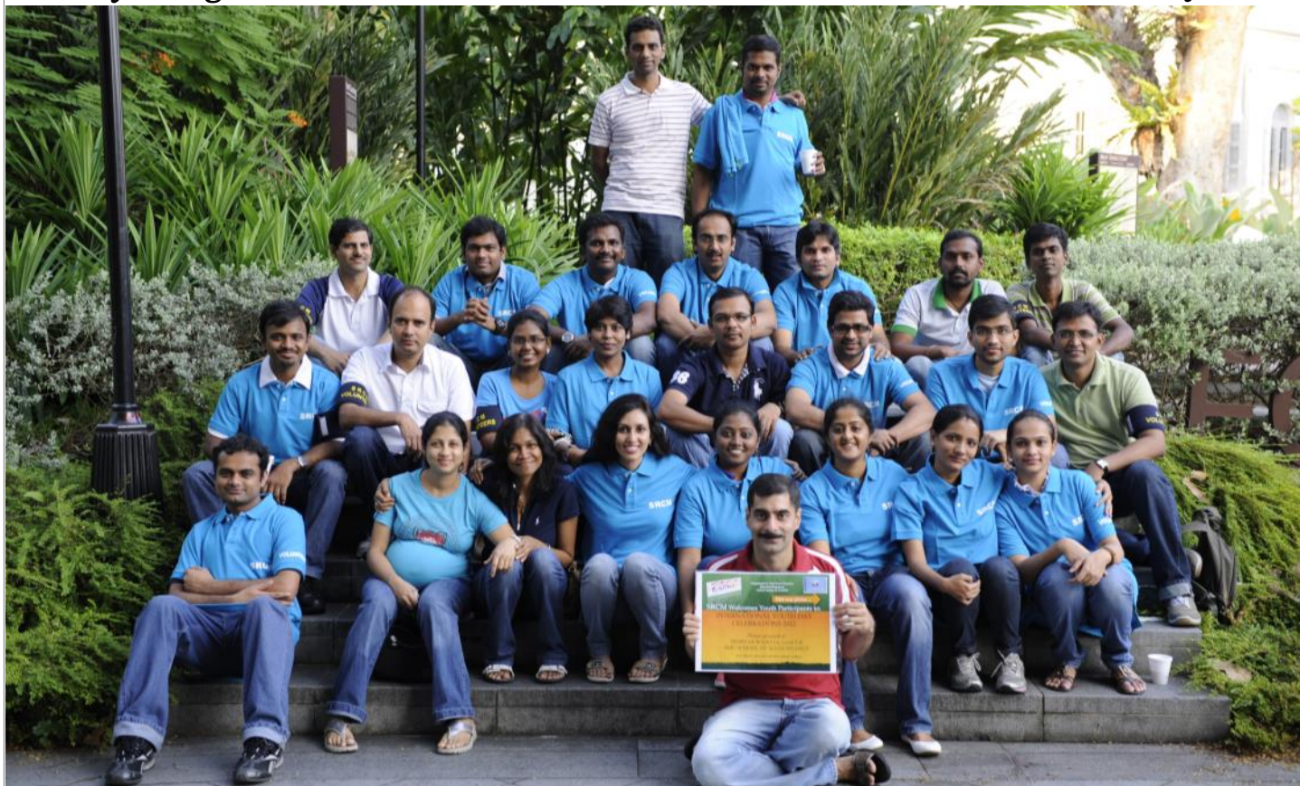
International Youth Day 2012, Singapore