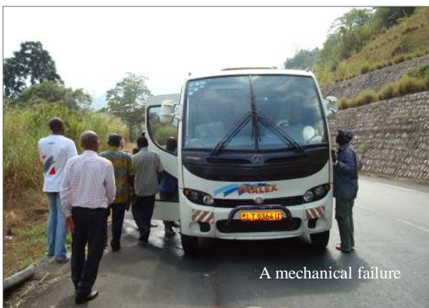
A mechanical failure