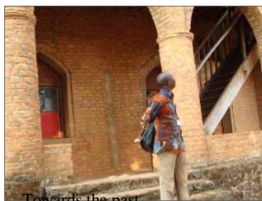
Towards the past

During this seminar, we learned, we were exhorted, guided, motivated, and we particularly felt our Master love through you. We look forward to more and more of events