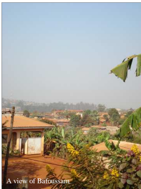
A view of Bafoussam