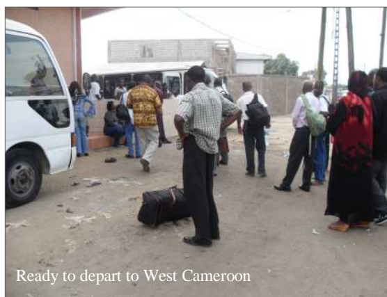
Ready to depart to West Cameroon

whether a demanding work like mine would give me time in December to attend the seminar. I had to inform my boss about my interrupted vacations and wanted to take some days off in December... he didn't argue this time, I know for sure Master was clearing the way for me. I just realized that was the reason I was called back to