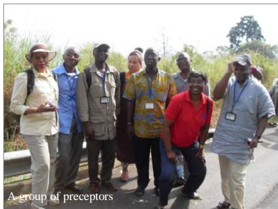
A group of preceptors