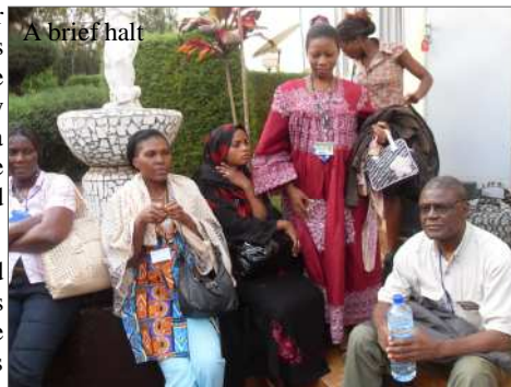
A brief halt