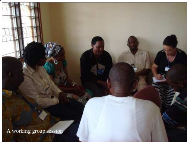
A working group session

Physical Master among us; the condition of the room was imbued with his presence. The subsequent questions and answers session was