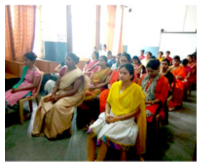
On International Peace Day 2017, teachers at the Children Academy School in Vijay Nagar, Ghaziabad, India, explored the use of Heartfulness Meditation as a way to promote inner peace and balance.

Participants learn about the Sanctuary and are offered an introduction to Heartfulness Meditation