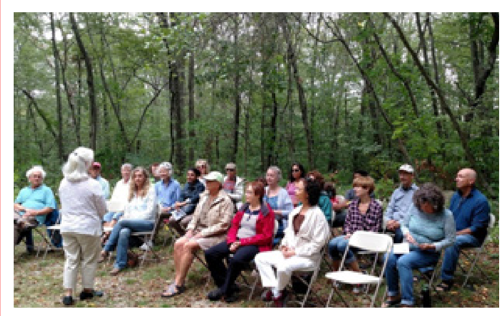
Seekers of peace gather every year, on Sept. 21, at the Peace Sanctuary in Mystic, Connecticut, USA.

In Hyderabad, India (in the state of Telangana) more than 300 persons participated in a guided relaxation exercise on International Peace Day. Representatives of Heartfulness Meditation Centers set up booths where passersby could participate in the exercise by sitting comfortably and slipping on a set of headphones.