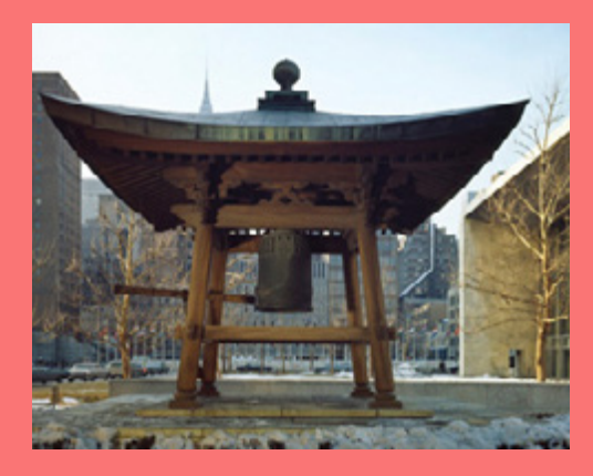
The Japanese Peace Bell, located in the area north of the Secretariat Building at United Nations Headquarters.

In commemorating Peace Day, we seek to hasten the evolution of peace -- from cease fire to absolute peace.