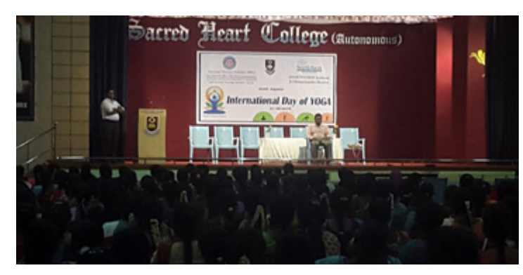
A Yoga Day meditation class was conducted at Sacred Heart College, in Tirupattur, Tamil Nadu, India.