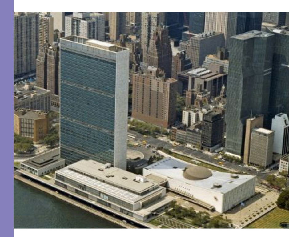
UN Headquarters, New York City.

The mission of the United Nations (as set out in the preamble to the U.N. Charter) is to promote "solidarity, good will and collective responsibility among the world's nations and peoples in order to establish a lasting peace and sustainable development for all."