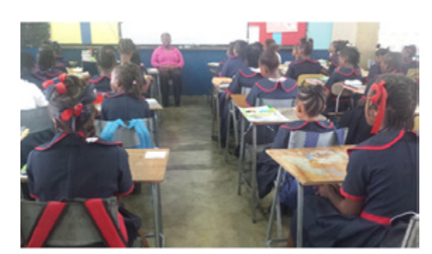
An instructor at the Allman Town Primary School in Kingston, Jamaica, guided students in a relaxation exercise on International Day of Peace.