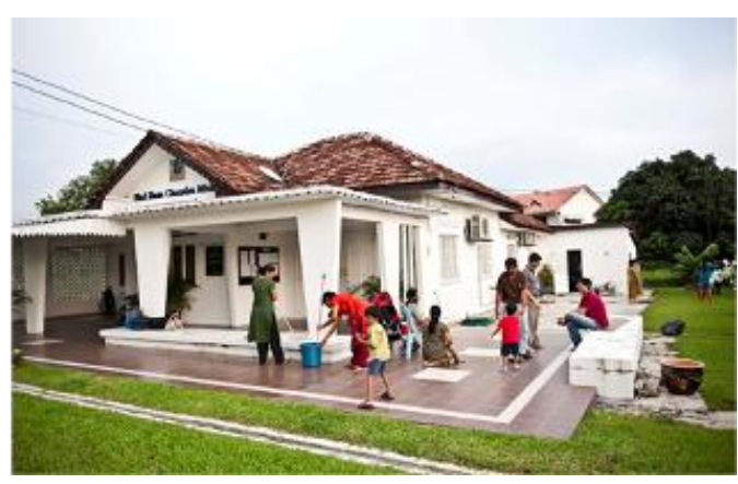
Malaysia-Singapore Retreat (21st and 22nd January 2012, Klang Ashram)

n ashram retreat was jointly arranged by Malaysia and Singapore abhyasis on 21st and 22nd January 2012, providing an opportunity to immerse in the ashram atmosphere for two days. All the 73 abhyasis felt love and joy in the spiritually charged Klang ashram, the first of many in South-East Asia.