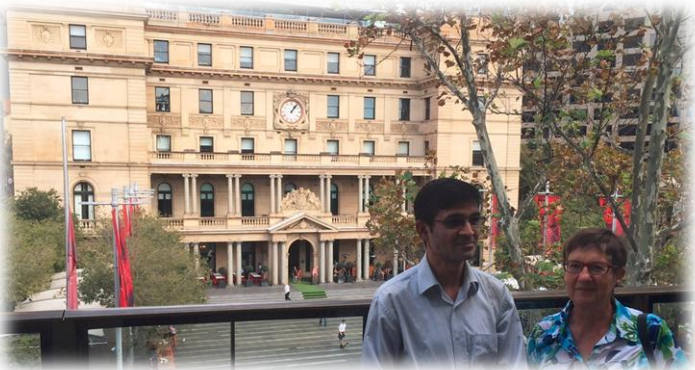
Venue: Customs House, Circular Quay

This is an idea which we recommend the other local centres to also try out.