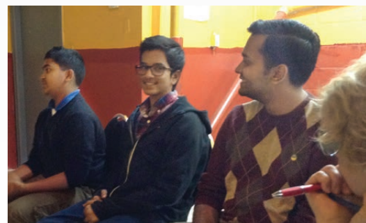
Youth leading groups in Toronto.