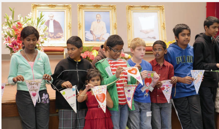
Children at the Dayton Gathering.

The large attendance number overall was surely influenced by the special effort made to include children and young adults. The youth volunteers planned many special and enjoyable activities for them, so more families felt comfortable attending. Sixty-one children brought their fresh and open hearts to the event. In the slideshow about the North American ashrams, Master was quoted as saying that ashrams are a place to cultivate inner calmness. Our Dayton family of abhyasis found the balance between the celebratory atmosphere and our need for inner calmness, as we enjoyed the excitement of so many sisters and brothers in one place, while also going within during the satsangs and the program, to be refreshed and renewed by Master's grace.