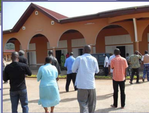
Stop at Mabine