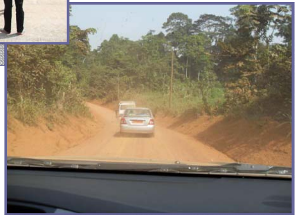
Driving to Mabine