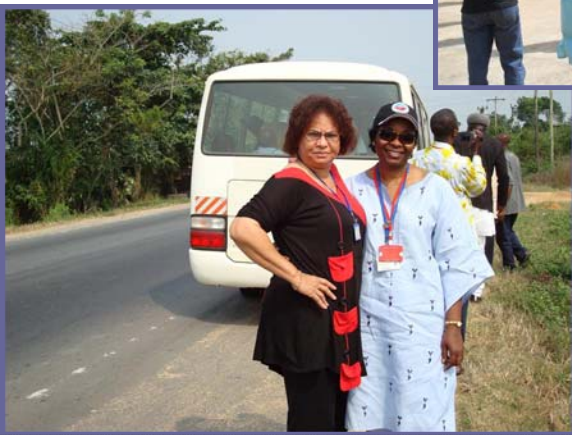
Around Mont Cameroon