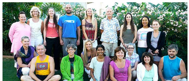
ATP Level 1 Hawaii Gathering, Dec 2010

From the ATP reports we have seen the need for the program and its effectiveness: It provides clarity for how we approach our daily practice. Our hope is that each abhyasi in North America will attend the Level 1 program at least once. Level 1 is prerequisite for Level 2 coming this spring. Chrisj40@aol.com