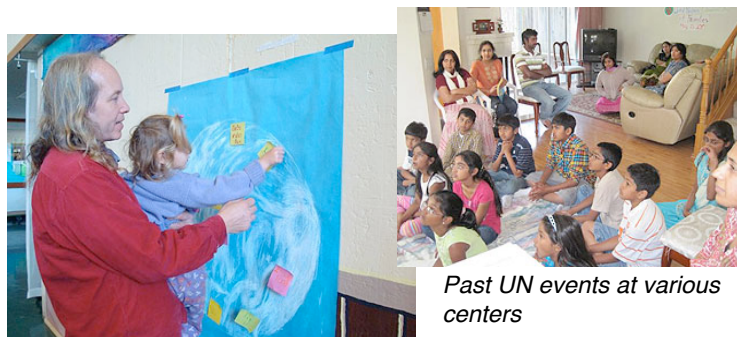
Past UN events at various centers

SRCM was formally associated as a Non-Governmental Organization (NGO) with the United Nations Department of Public Information in 2005. SRCM contributed the Universal Prayer to the UN charter to complement efforts made by numerous other organizations to serve humanity in their own unique way. The idea behind observing UN days is that at these events, abhyasis, their friends, families, neighbors and associates can come together in a silent, non-denominational prayer-meditation for the integration of humanity and the well-being of the people of the world.