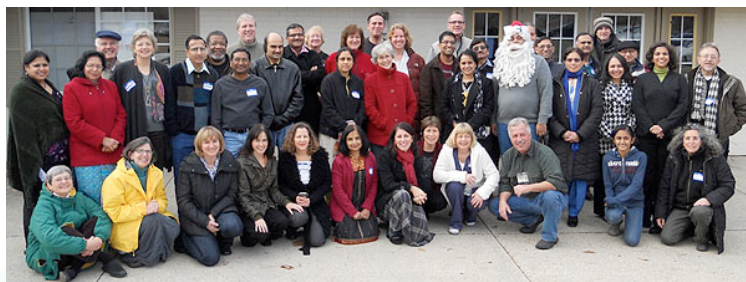
Dayton, December 2010

From East to West and North to South, Prefect Training Programs were held in all six regions at selected centers from December 2010 through February 2011. Most prefects (in groups of 25-40) were able to attend the workshops, which