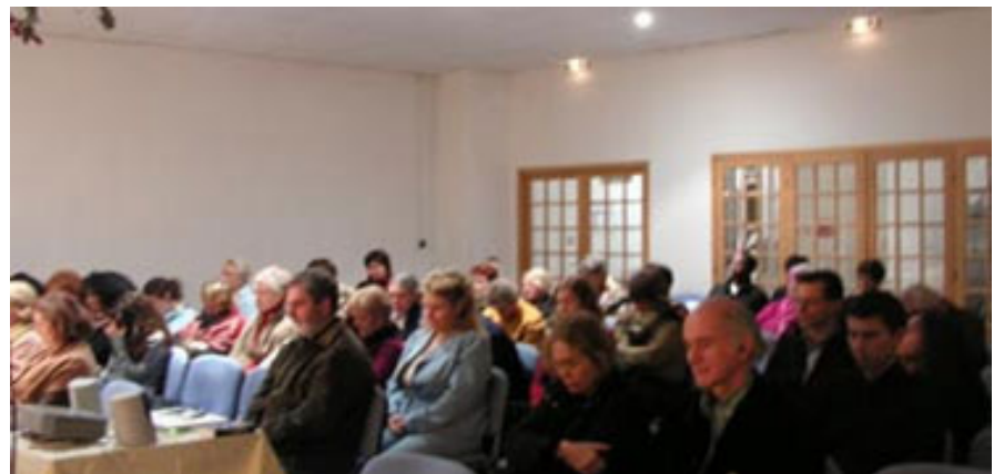
Paris Ashram: Human Rights Day observance with UN Regional Information Centre, joined by brothers and sisters in Montpellier, Nice, Lyon, Marseille, Toulon, Lausanne, Copenhagen, Edinburgh, Galway, London, Toronto and Cleveland.

ON NOVEMBER 16, INTERNATIONAL DAY OF TOLERANCE, following on the success of the Peace Day events, Austin centre and University of Texas Natural Path Meditation, co-hosted a workshop. General public, university community and neighbours were invited to participate. Prior to the event, Austin centre representatives spoke on the theme of Meditation for Human Integration at the University Inter-Faith Council and were invited to the 5th annual interfaith fast-breaking dinner of the Institute of Interfaith Dialog attended by notables of all religious backgrounds. ‡