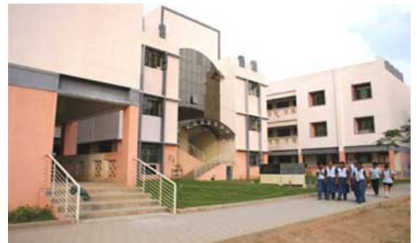
Omega is located in Chennai and offers Cambridge University's International Examinations and Indian Central Board of Secondary Education certifications.

The driving force at Omega school, its teachers proudly say, is the Value Based Spiritual Education (VBSE) that aims to impart the message of a balanced life, one equally progressive and luminous in inner and outer existence. Building on UNESCO's Core Values , Omega has adopted the Nava Ratnas (nine gems) of life: Truth & Wisdom; Love & Compassion; Sensitivity & Creativity; Spirituality; Peace & Justice; Self Awareness/ Self-Management; Environmental morality; Citizenship; Health and Nutrition. Each class has a weekly time dedicated to VBSE. Teachers are encouraged to incorporate the Nava Ratnas in the main curriculum as well as embody them in interactions with the students. The students' day begins with morning assembly and ends with Circle Time with their class teacher who facilitates ideas for children to practice the Nava Ratnas in their lives. ‡