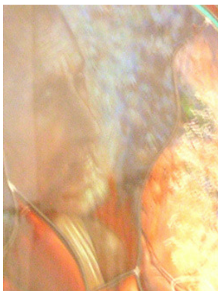
Painting in a glass panel of Revered Babuji Maharaj at Babuji Memorial Ashram, Chennai