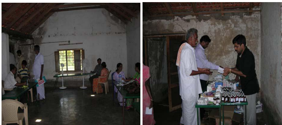
(above) Patients undergoing treatment at Gaanalu Village, Kanakapura

The camp was quite successful in reaching out to a good number of people who were in need of medical services. The villagers expressed their gratitude to the doctors and the volunteers. It was decided to hold these camps at frequent intervals of once in three months to ensure availability and accessibility of medical care to the villagers.