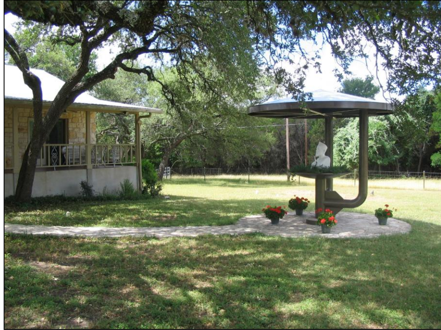
(above) A view of SPURS Retreat Ranch

The end of June marks the tenth month since the opening of SPURS Retreat Ranch in Austin, Texas. To date, eighty-one sisters and brothers have come here on alternate months, withdrawing from jobs, family, and worldly concerns for periods of three to fifteen days in order to give a more concentrated effort to their practice and to dive deep within themselves to experience their real Self and Inner Master.