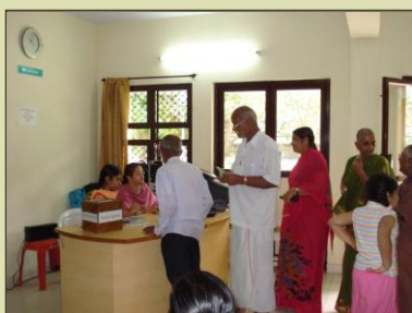
Patients at FMC, Chennai

Free Medical Centre (FMC) at Manapakkam has treated a total of 27952 patients in the year April-2007 to March-2008. The breakup is given in table above.