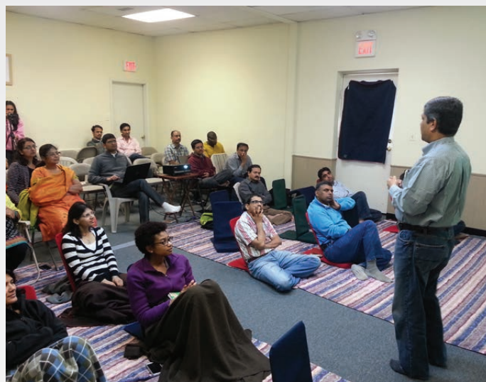
Richmond Center, VA