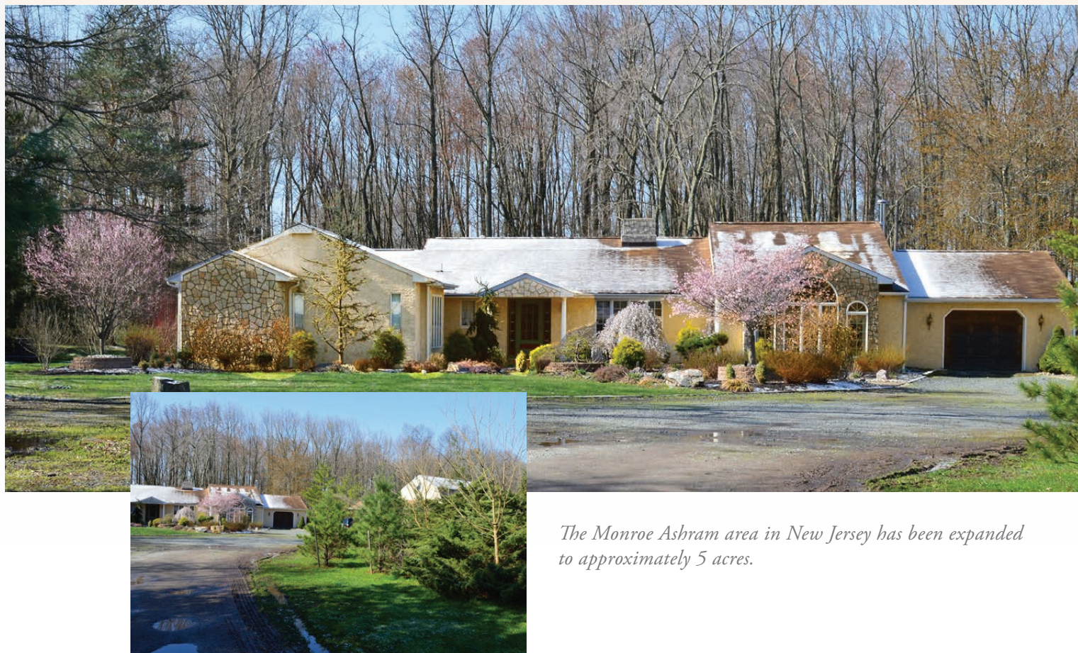
The Monroe Ashram area in New Jersey has been expanded to approximately 5 acres.