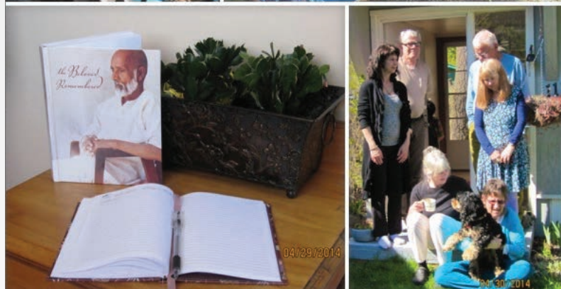
Nelson Centre, BC