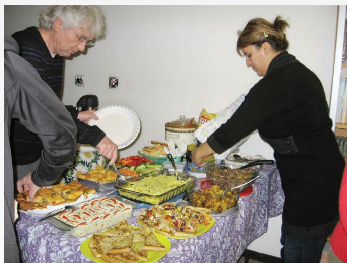
Vancouver Centre, BC