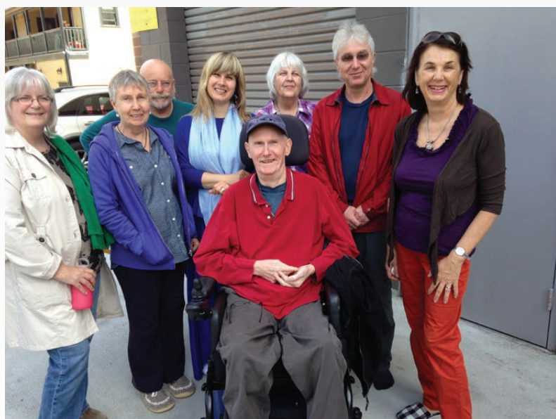
Vancouver Centre, BC