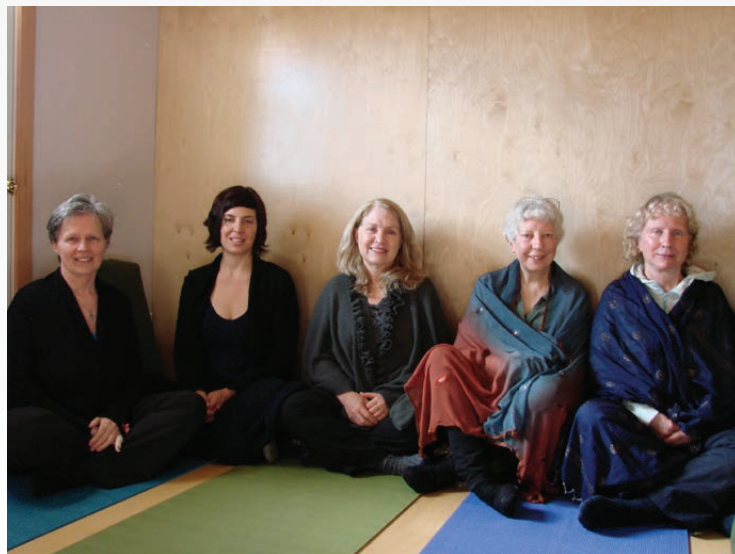
Masset Centre, BC

Our new Canadian ashram in Mississauga fills our heart with joy and connectedness.