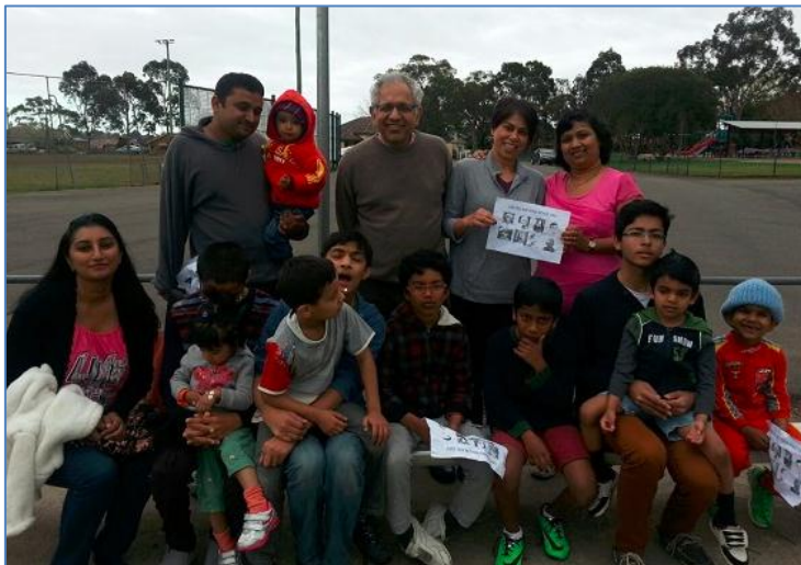
UN Peace Day - Sydney

Master addressed all abhyasis around the world on 26 th October. The centre had a whole day event on this day with two group meditation sessions at the usual Sunday group meditation venue. All abhyasis listened to Master's broadcast together.