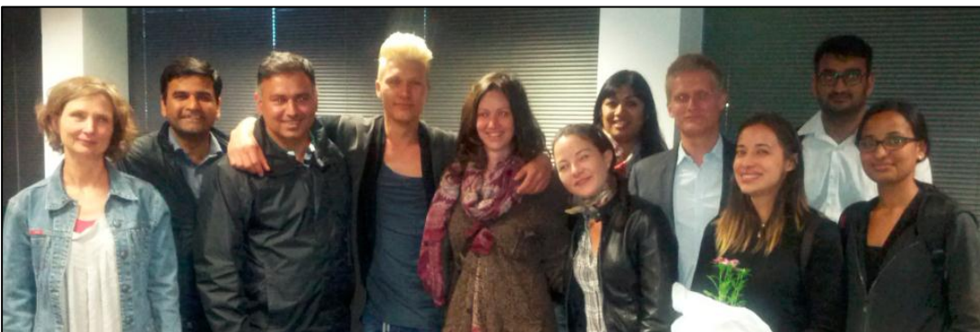
Above: UN International Children's Day - Perth