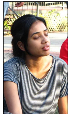
National Seminar - Brisbane