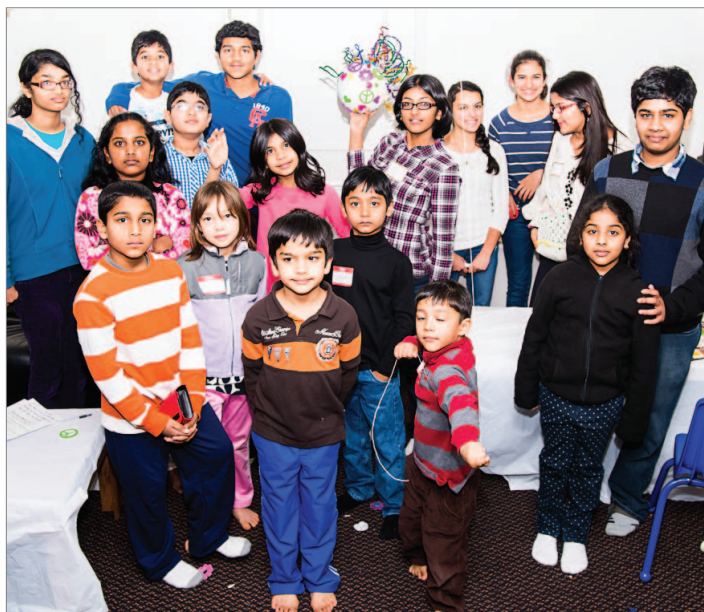
The New Year's Midnight Ball at Sunderland Ashram

The gathering, needless to say, was awesome, and the kids seemed to be busy with activities at times, and just playing at other times. Eventually, we said our goodbyes and came back to Toronto feeling all charged up to face a new year. As we opened the front door of our home and started putting all the luggage inside, my daughter came up to me and said these very powerful words: "Thank you so much for taking me there, Mama. I had an awesome time in Detroit. You were so right about keeping an open mind. It was so amazing there."