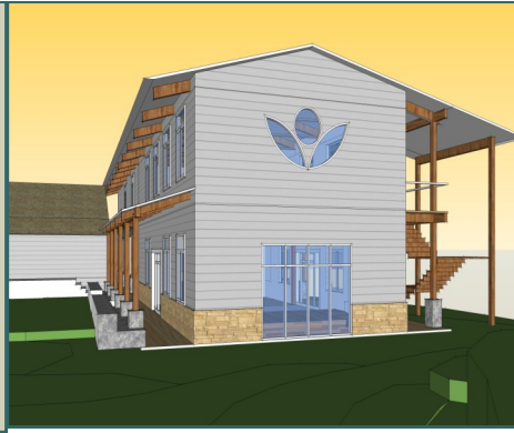
Exterior view meditation hall