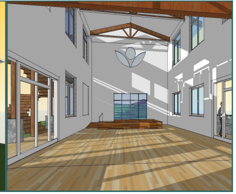
Interior view meditation hall