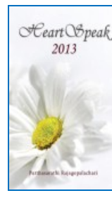
Heart Speak 2013 English