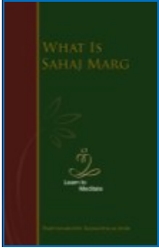
What is Sahaj Marg English