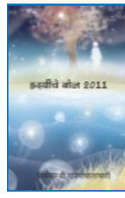
Heart Speak 2011 Marathi