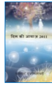
Heart Speak 2011 Hindi