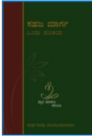
What is Sahaj Marg Kannada