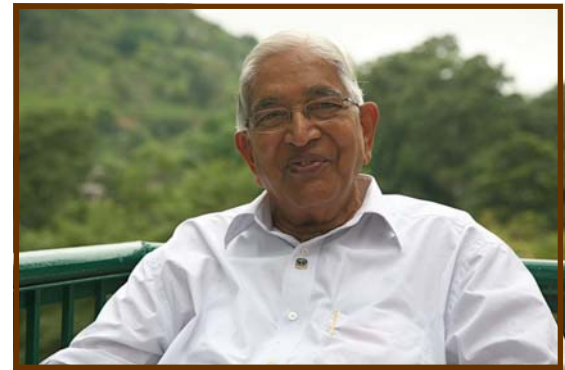
Top Photo On the way to Satkol (Naukuchiya taal)