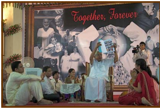
Top Photo Celebrations Lucknow Centre Photo Babujis House