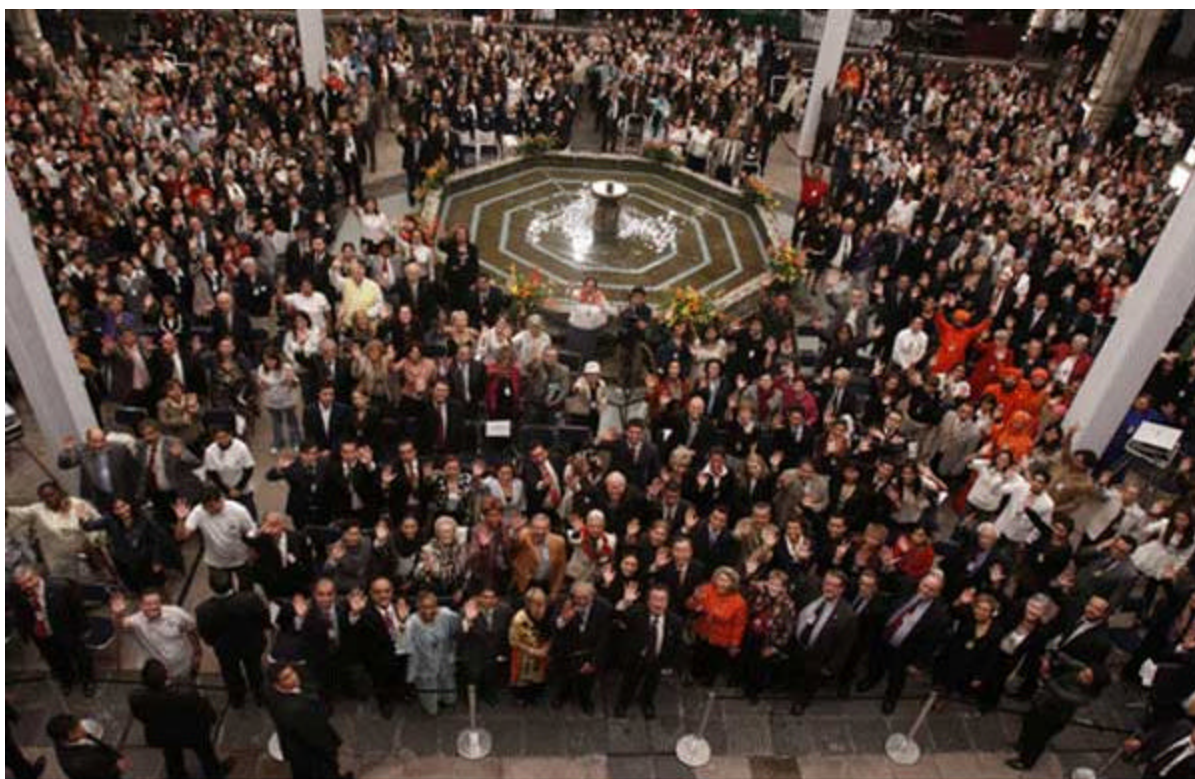
UN Secretary-General [centre] at the close of the opening ceremony of the 62nd DPI/NGO Conference in Mexico City

Location: Mexico City, Mexico Date: 09 September 2009