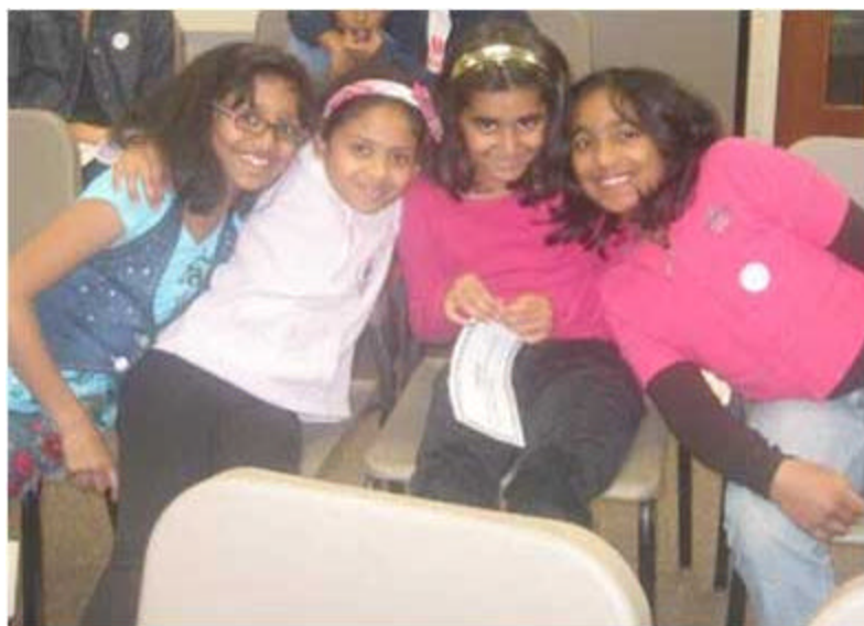
Left: Shri Ram Chandra Mission celebrates Universal Children's Day at Briarwood Elementary School in Bowling Green, Kentucky, USA. Below: Humboldt County Centre's "Pin A Wish On the Planet"

“IN Mystic, Connecticut, parents and children alike enjoyed themselves so much that they asked if they could do it again next year on November 20. In Humboldt County Centre the game, “Pin a Wish On the Planet”, included wishing no more war, that everyone have healthy food to eat, that we use natural resources sustainably, that global warming disappear, equality and fairness for all, that everyone loves everyone, and kindness prevails.