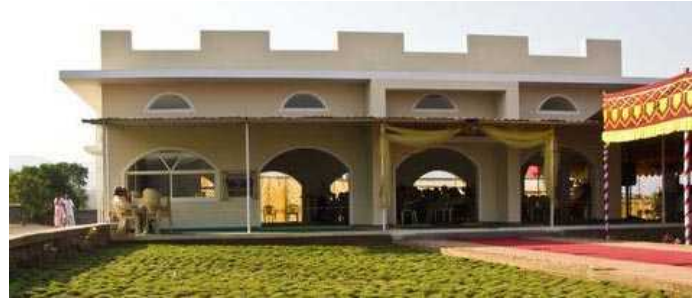
CREST Retreat Centre, Panshet