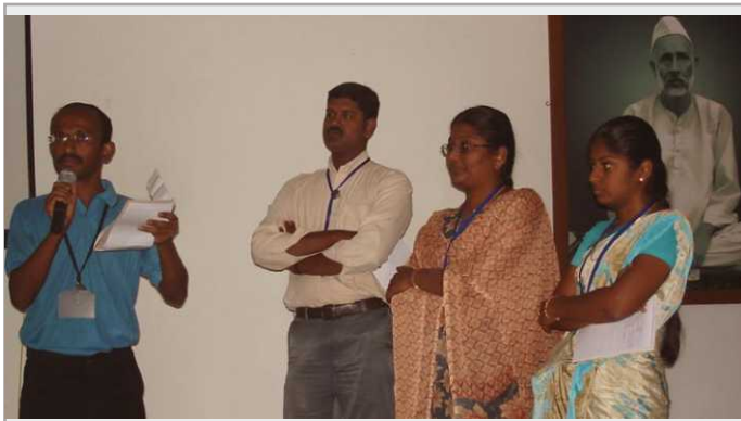
Youth Workshop, Coimbatore