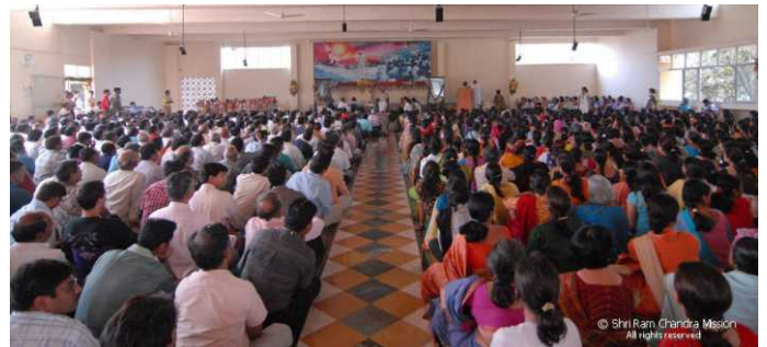
Panvel Ashram - Meditation Hall