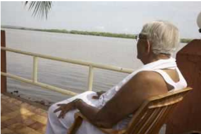
Master on the banks of the Mandovi, Goa

Master's visit to Mumbai coincided with the festival of Holi, when evil and impurity are burnt in the 'holi fire' after which people dance around the fire, which has sanctified them. Holi is a festival of colours depicting rejuvenated life. True that there were no colours around but everyone could experience the different shades of peace, love and joy in the inner most core of their hearts.