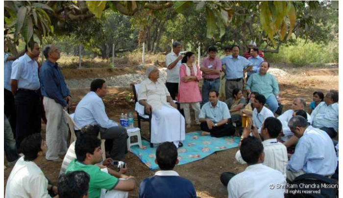
Panvel Ashram - Under the mango trees