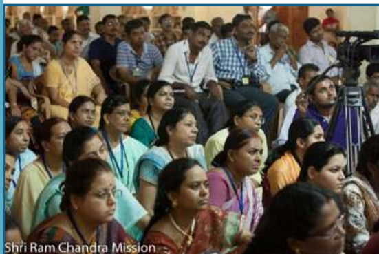
Shri Ram Chandra Mission