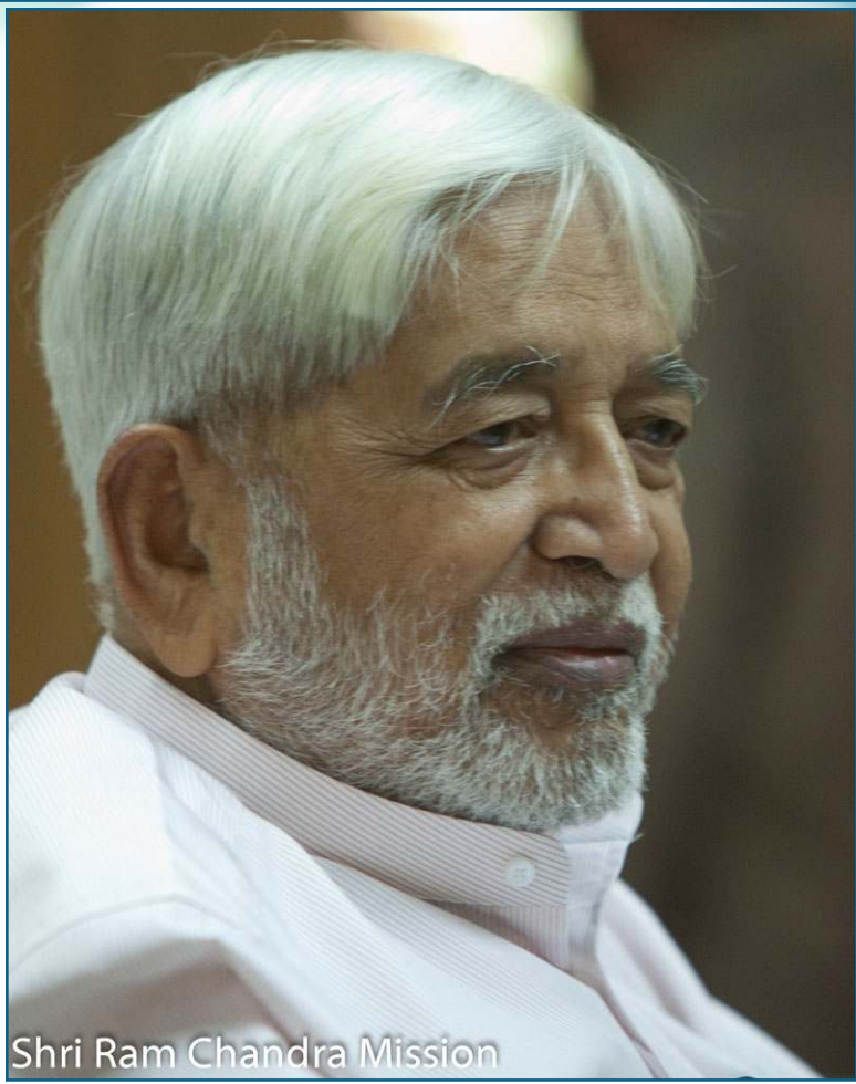
Shri Ram Chandra Mission