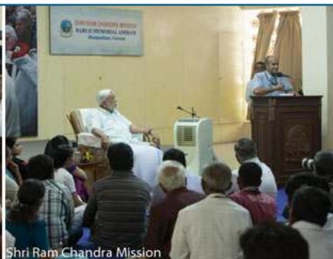
Shri Ram Chandra Mission