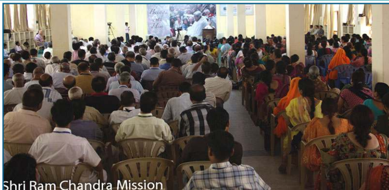
Shri Ram Chandra Mission