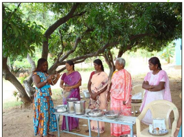
July 18, 2011 — at Krishnagiri Ashram