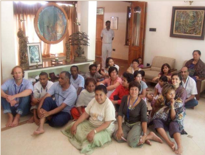
July 12, 2011 — In Master's Cottage, in Manapakkam

We reach Manapakkam on July 12th at 3:00 AM, and we naturally congregate in front of the cottage after the 9:00 AM meditation. We were about twenty from Reunion and