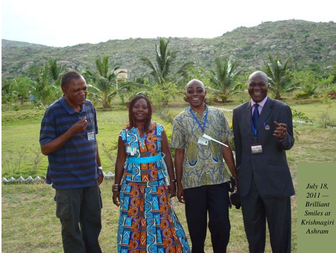
July 18, 2011 — Brilliant Smiles at Krishnagiri Ashram