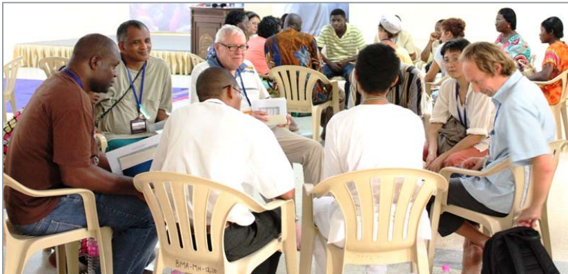
July 16, 2011 — Group session in Manapakkam

During the seminar, several speakers developed important themes: "unity in diversity", "spiritual practice", "Perfect love dispels fear," "spreading Sahaj Marg", followed by questions and answers sessions. The seminar was truly an impetus to make us become as points of light meant to relay light across our respective countries and thus illuminate the whole continent which will then merge into the very source of Light: Master. Labeled as the "dark continent," Master said [about Africa that], "... I have personally believed that the darkness is in the hearts of the people – not in Africa ..."