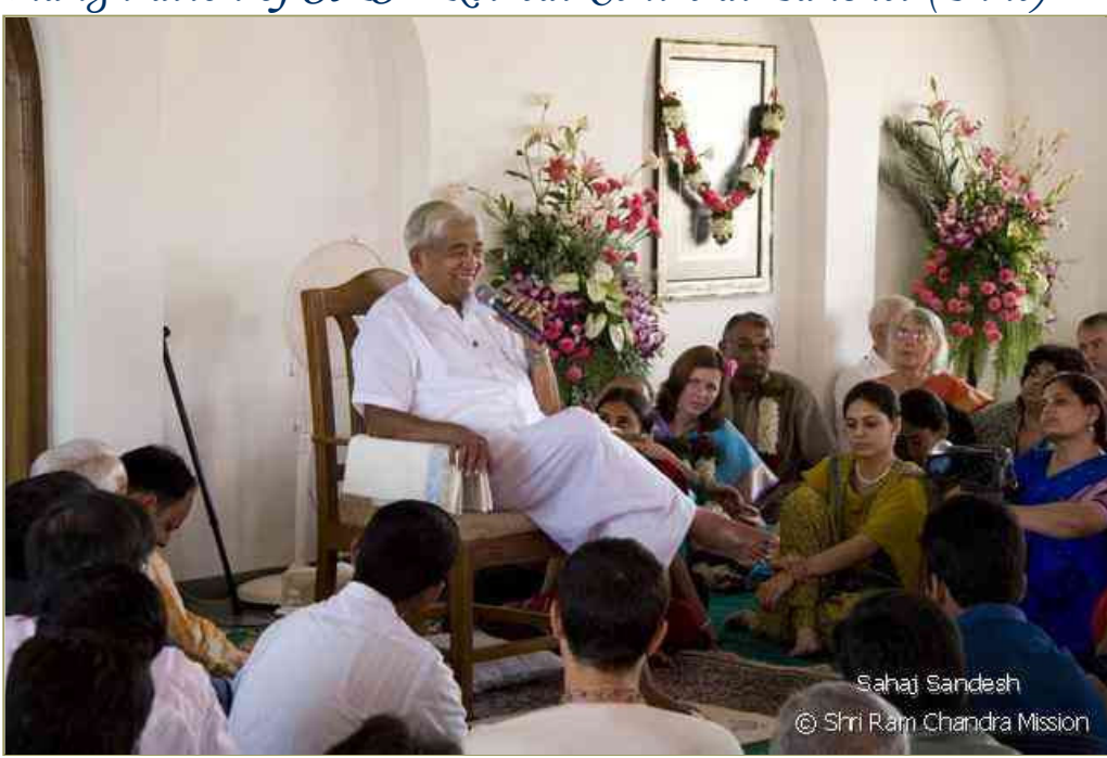
(above, below) Rev. Master at the inauguration of Panshet retreat centre

On March 14, 2008, Rev. Master inaugurated the second SMSF retreat centre in India, located in a picturesque setting in the outskirts of Pune, Maharashtra. This retreat center is located on the banks of the Khadak Vasla lake near the Panshet Dam, with rolling hills surrounding the area. The facility includes a meditation hall,