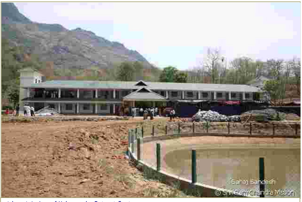
(above) A view of Malampuzha Retreat Centre