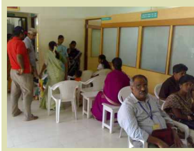
(above) Waiting hall