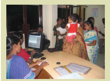
(above) Registration counter