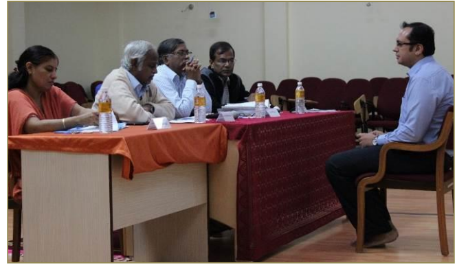
(above) Panel conducting examination of a research scholar during the University of Mysore course work