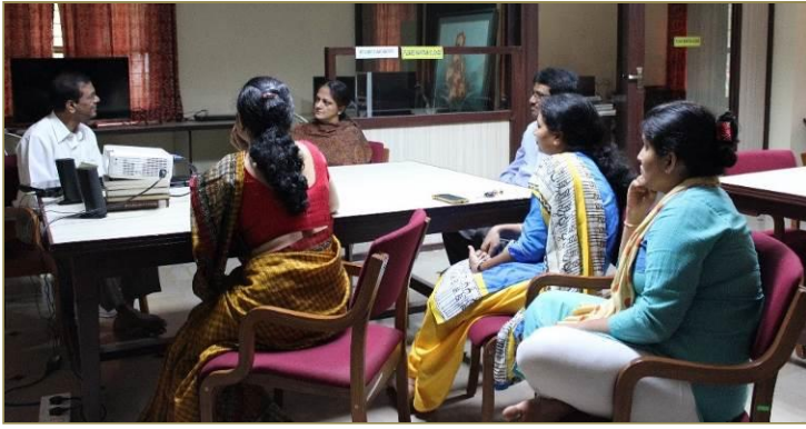
(above) Participants of the seminar 'Work Place Ethics'