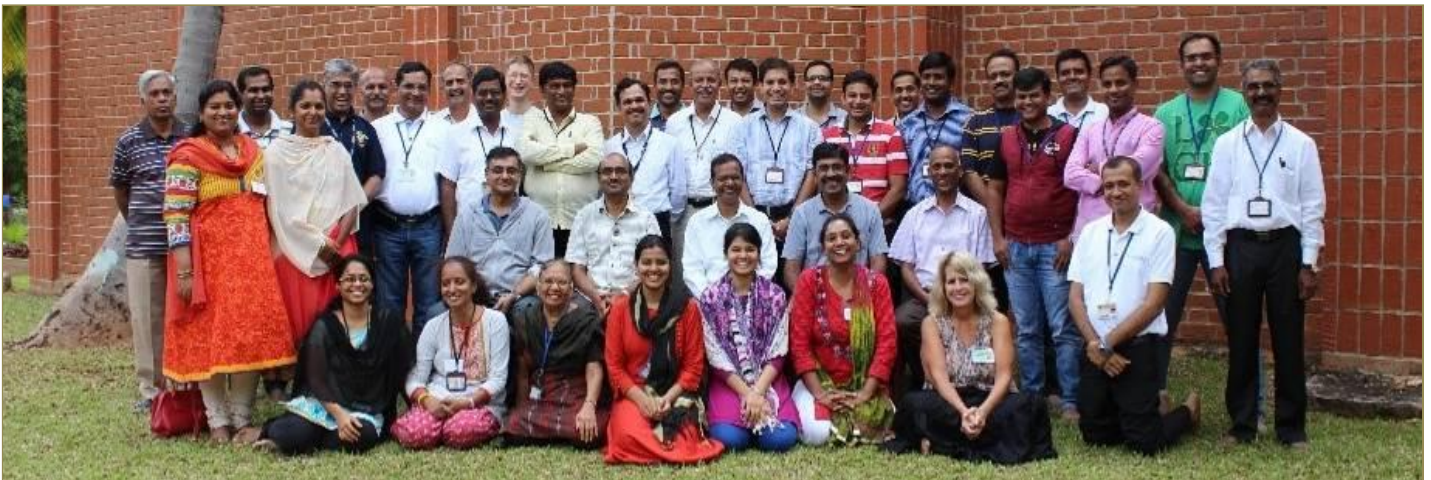
(above) Participants of the Heartfulness C-connect program