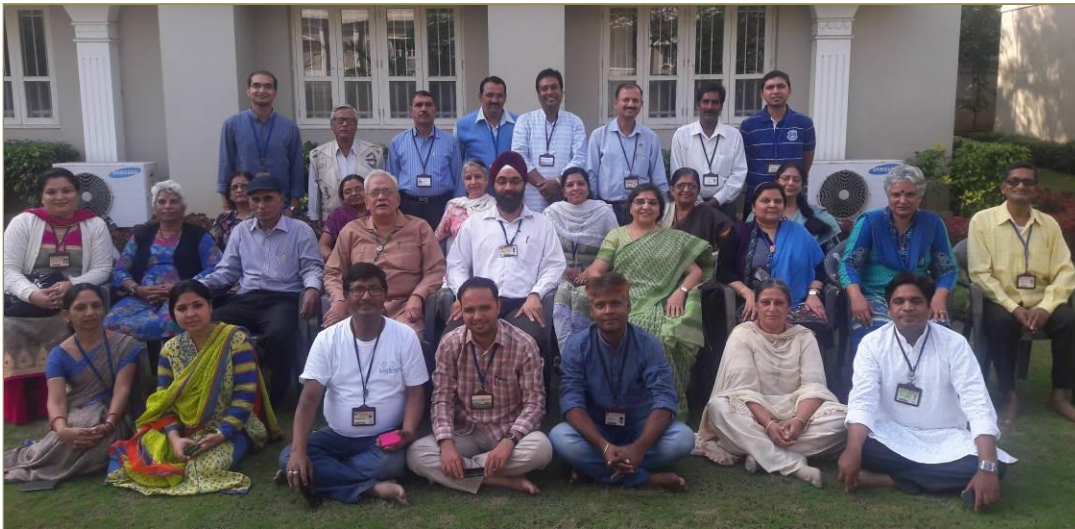
(left) Participants of one of the 'Train the Trainer' workshops held at the Kharagpur retreat centre

During the last quarter, thirteen abhyasis visited Kharagpur to experience retreat at the Spiritual Retreat Centre. Besides the normal retreat activities, the premises were the venue for day to day activities of the Kharagpur centre of the Mission. Four workshops on 'Train the Trainer' for Heartfulness program were also conducted during this quarter.