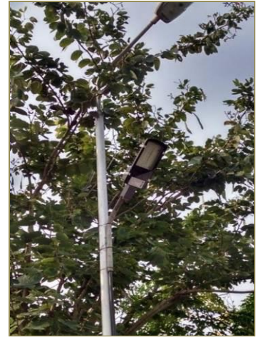
(above) LED lights installed in the Pune retreat center campus

Abhyasis who wish to apply for retreats either at the Malampuzha, Pune or Kharagpur centers may find more information about these facilities and the retreat program at: http://www.sahajmarg.org/smww/retreat-center-overview . Abhyasis who wish to enroll for retreat programs may now apply online at the address given above.