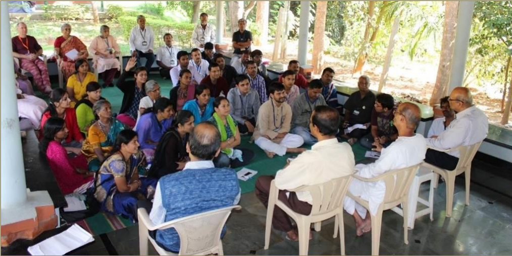
(left) Participants of the workshop "Respect for Guru" conducted from 22 nd to 26 th December 2015 at CREST, Bangalore