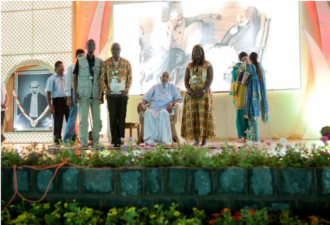
July 22, 2011 — Tiruppur

moment of four-fold happiness: the inauguration of a celebration, the blessing of a union, the merging of the African seminar into a universal celebration, and the recognition of Africa in the spectrum of geographical diversity of the