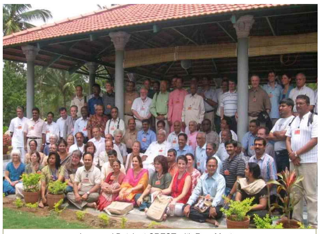
Inaugural Batch at CREST with Rev. Master

Education: We cover SMSF essay writing competition conducted in schools of India.