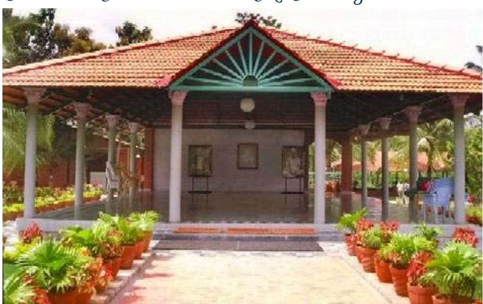
Meditation hall at CREST, Bangalore

After the big inaugural batch CREST had been idle for quite some time. Some pending civil works were getting completed. After these works were finished, CREST was "crestfallen" after Master and abhyasis left. satsangh at 9 am; participate in classroom presentations and disc do shramdaan (voluntary work) hour; cleaning at 6 pm; introspe silence for an hour; do 9PM univ prayer; and do bedtime prayer.