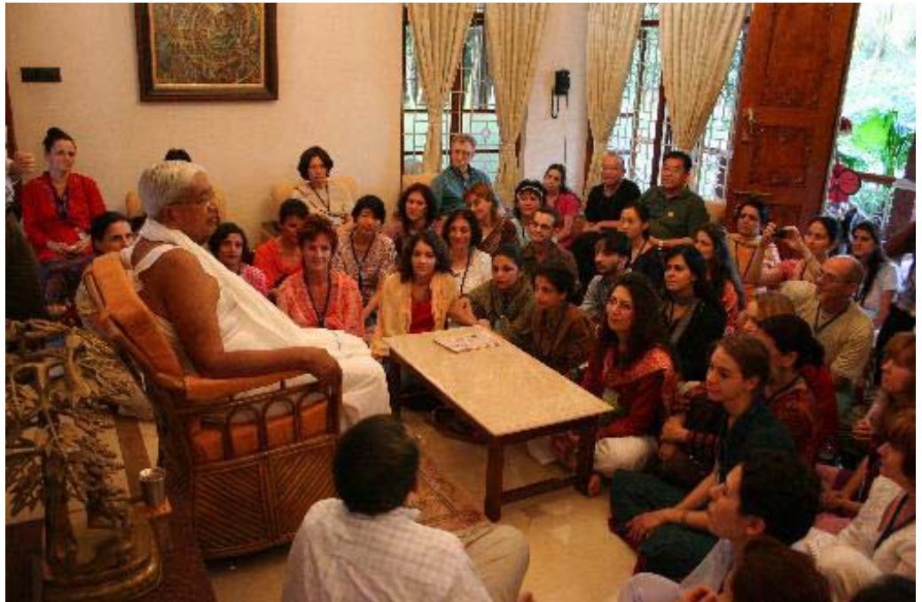
Rev. Master with Scholars of STP-2006

Education: We cover Rev. Master participating in Children's day celebration in Lalaji Memorial Omega International School, Chennai.