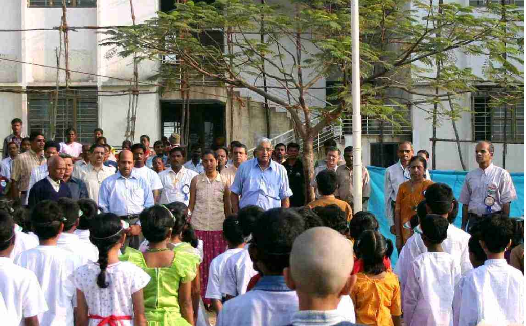
Revered Master hoisted the Republic Day Flag in Lalaji Memorial Omega School on Jan 26, 2006.

Malampuzha, India. Spiritual training: A training center at Bangalore, CREST, is getting ready. This will impart training in Spirituality, Religion and the Practice of Sahaj Marg. Scholars Training Program has been conducted recently for 40 Abhyasis from 26 different countries. In this issue, we cover Short Stories section in Sahaj Marg website that is useful to impart values to children.