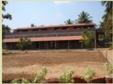
Dormitory and Guest Rooms at CREST Bangalore