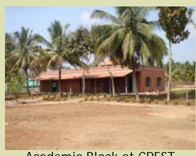
Academic Block at CREST Bangalore