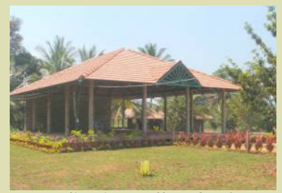
Meditation Hall at CREST Bangalore

The location (URL) of this site is http://www.sahajmarg.org/youth/intro duction.html